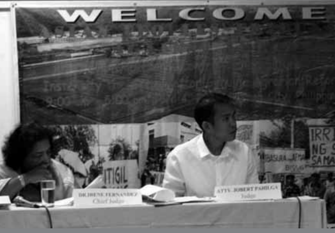
Judges of the Asian People's Tribunal against IRRI 2006